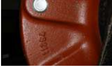
5 digits number__wheel hub

2. If there is no identification plate, you can read the five/six-digits number molded in cast iron (wheel hub, beam central body, differential support, swivel housing, etc).