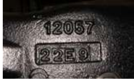
5 digits number__beam central body