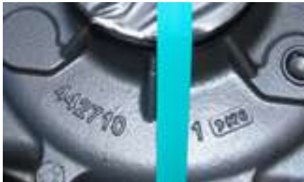
6 digits number__half housing transmission