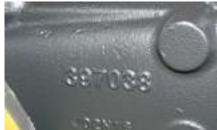
6 digits number__axle beam

This code allows the identification of the axle or transmission, making possible to identify the correct number of the component.